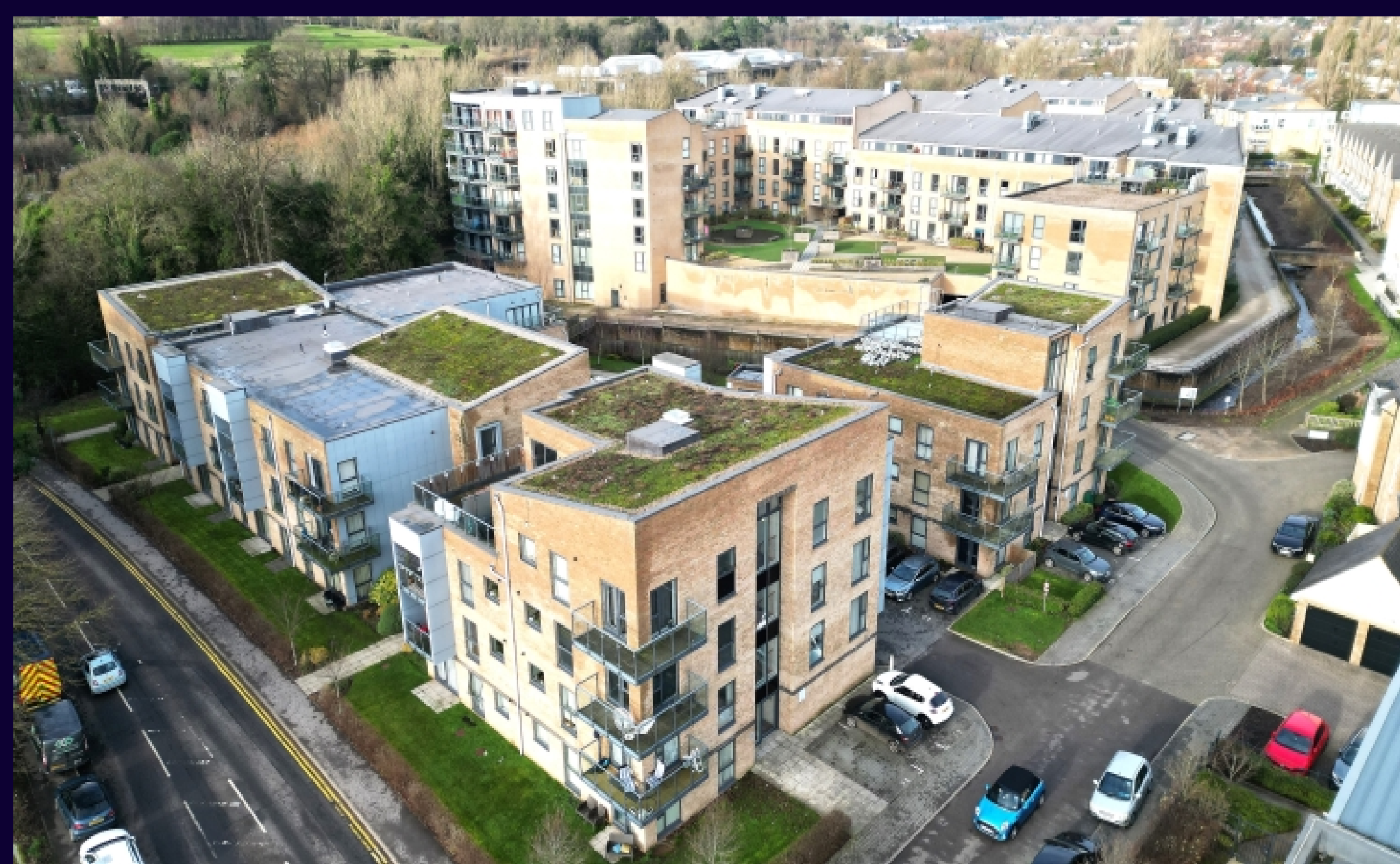
Mill House Rose Lane, Nash Mills Wharf, Hemel Hempstead, HP3 9GL