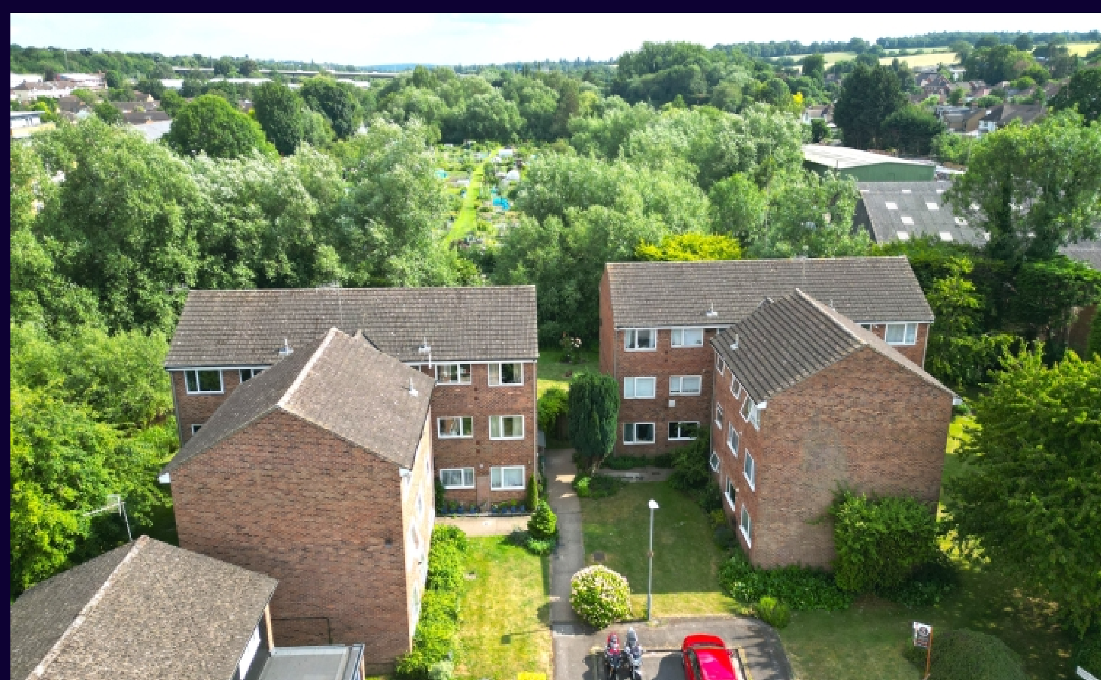
Riverside Close, Kings Langley, Hertfordshire, WD4 8HQ