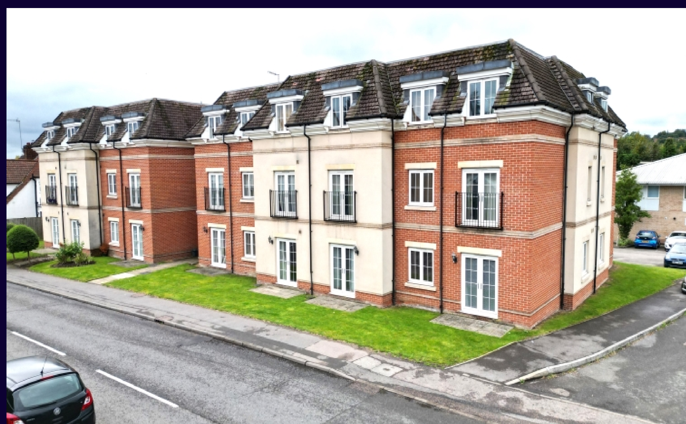
Navarre Court, 10 Primrose Hill, Kings Langley, Hertfordshire, WD4 8FS