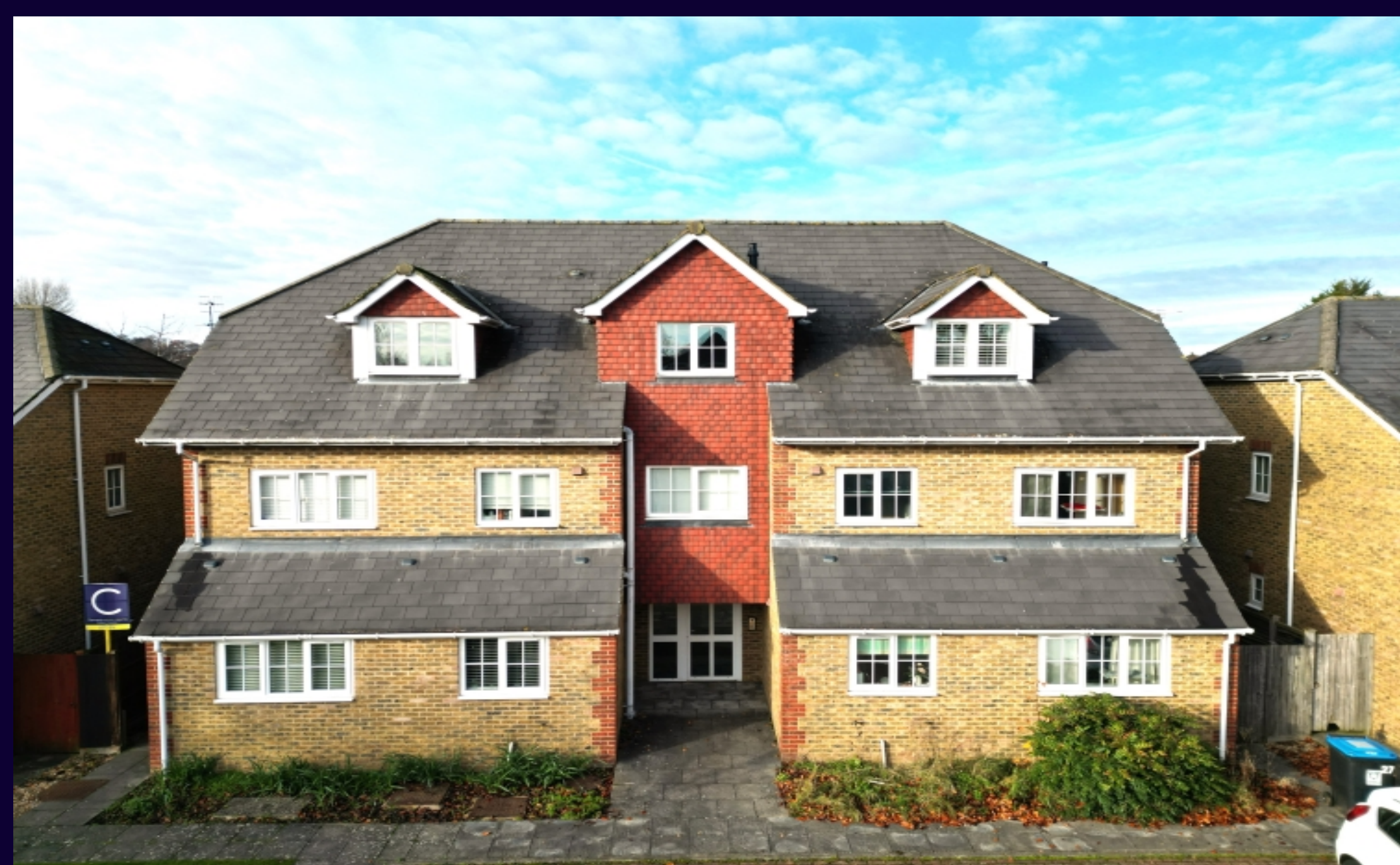
The Mallards, Hemel Hempstead, Hertfordshire, HP3 9DP