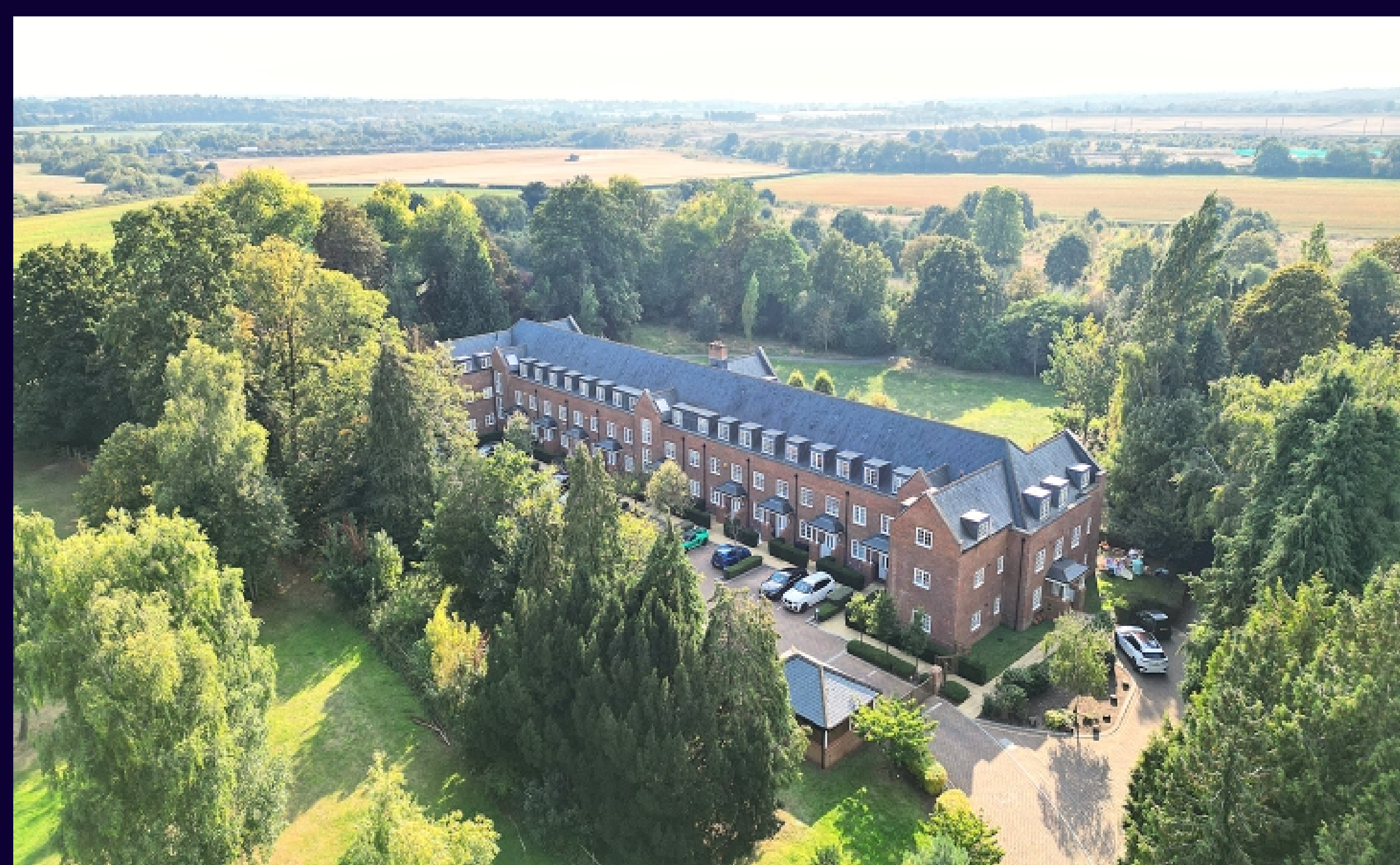
Little Night Leys Court, Pegrum Drive, London Colney, St. Albans, AL2 1FB