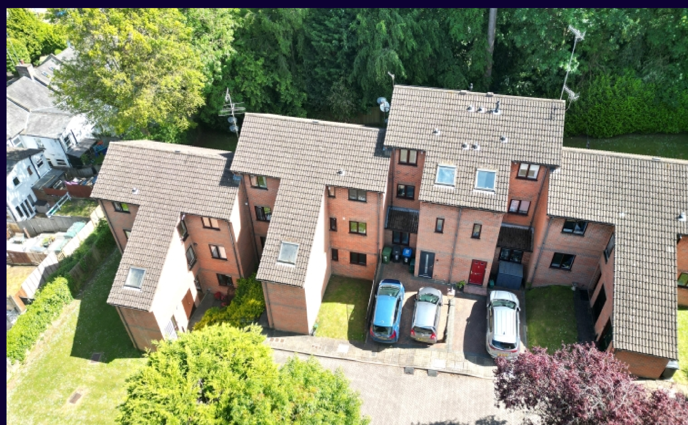
The Farthings, Hemel Hempstead, Hertfordshire, HP1 1XD