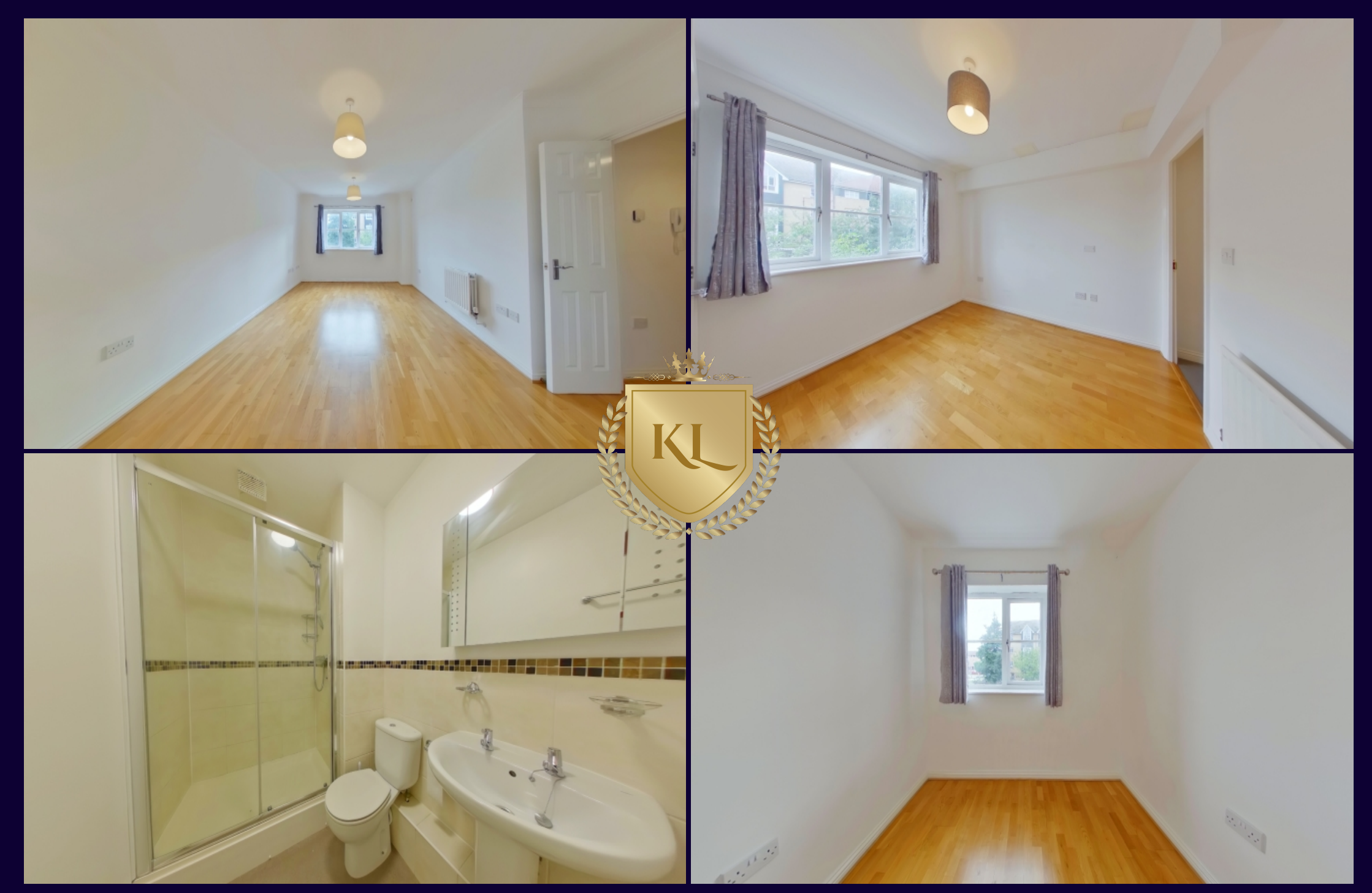
Kings Langley Estates wishes to inform prospective buyers and tenants that these particulars are a guide and act as information only. All our details are given in good faith and believed to be correct at the time of printing but they don't form part of an offer or contract. No employee of the company has authority to make or give and representation or warranty in relation to this property. All fixtures and fittings, whether fitted or not are deemed removable by the vendor unless stated otherwise and room sizes are measured between internal wall surfaces, including furnishings.