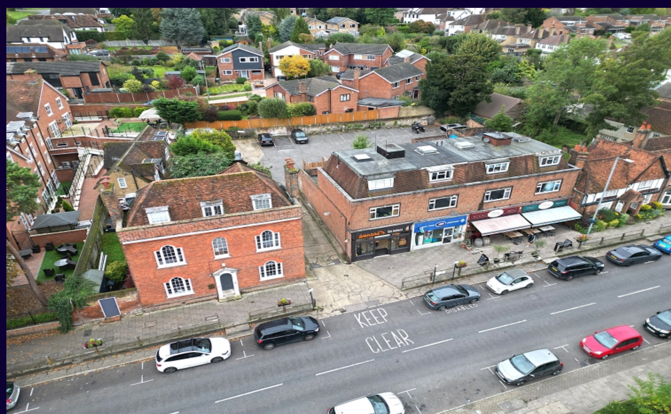
High Street, Kings Langley, Hertfordshire, WD4 8BH