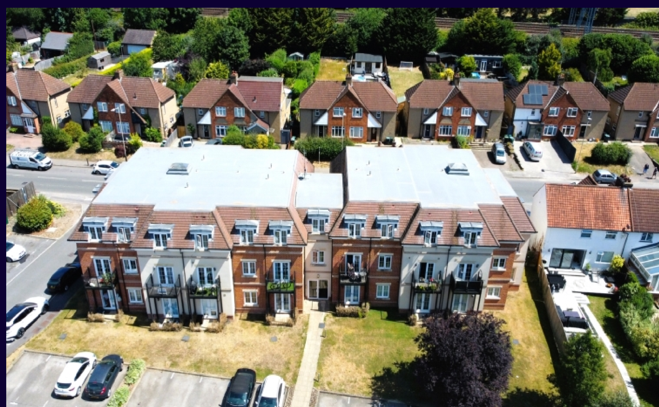
Navarre Court, 10 Primrose Hill, Kings Langley, Hertfordshire, WD4 8FS